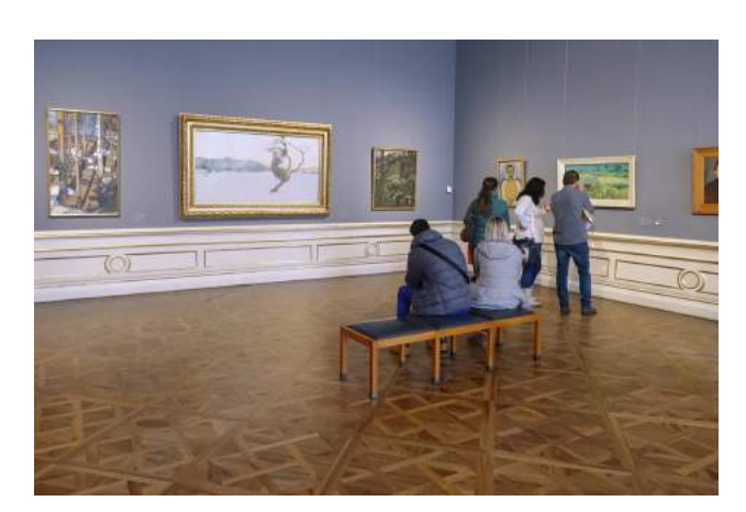
Figure 9. Installation shot with "Evil Mothers" (center) in BB

Additionally, the sight-line positioning of "Judith" next to the sculpture "The Nymph" and in visual relation to the "Portrait of Therese Bloch-Bauer" led visitors to notice and refer to stylistic similarities in the proud and/or seductive depictions of the female subjects. While many visitors were familiar with "Judith" beforehand (BB: 60.55%, BA: 74.67%), this was not the case with "The Evil Mothers" (BB: 10.09%, BA: 3.33%). Here, the content analysis of the subjective mappings foregrounds the general attractiveness of the painting in both BB and BA. On the one hand, this means that the painting with its bright landscape, trees, and (hidden) women as well as babies stimulated "close looking." On the other hand, the ambiguous title,