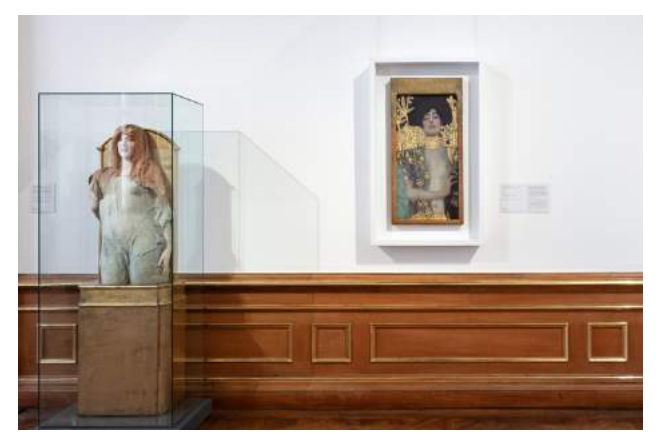
Figure 8. Installation shot with "Nymph" and "Judith" in BA

"The Evil Mothers," and the subtly suggested topics of motherhood and abortion stimulated further thoughts. In BA—with a mean viewing time increase of about ten seconds—this experience of a "double ambiguity" in the painting's style and content led to far-reaching interpretations and strong emotional reactions.