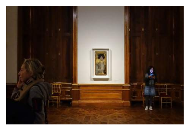
Figure 7. Installation shot with "Judith" in BB

in BA with references to the biblical story of Judith and Holofernes or a general "gender trouble", as indicated in the caption.