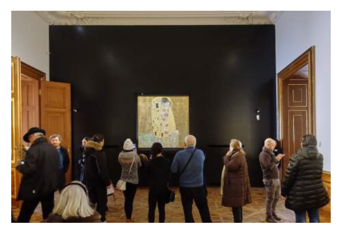
Figure 5. Installation shot with "The Kiss" in BB

according to viewing times shows a strong consistency between the higher and lower ranks of these thirteen artworks in BB and BA. Regardless of their display, certain artworks remain in the focus (see ranks 1–7), while others consistently receive less attention time (see ranks 8–13). Among the artworks in the focus of attention, there is of course "The Kiss," (see Figures 5 and 6) as participants often stated in the subjective mappings when they recalled their exhibition visit. This is not surprising, as "The Kiss" is the most prominent artwork of the museum and one that most visitors were already familiar with, having seen it before either in the original or as a reproduction (BB 77.98%, BA: 74.67%). In addition, works by widely known artists such as Klimt, van Gogh or Munch led to a heightened awareness, as visitors felt they "had to stop because it was from a famous painter" (ba-s075) or "of course [...] had to pay attention" (bb-s001) to these works.