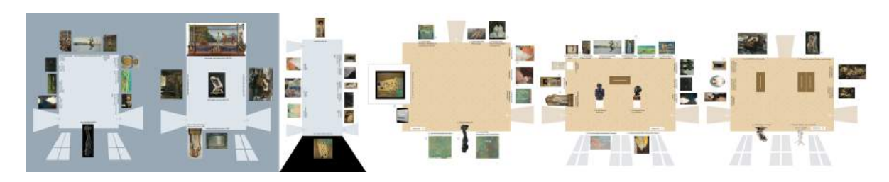
Figure 3. Map with 26 artworks in BB and map with 35 artworks in BA

Second, the art historical narration in the single exhibition rooms has changed drastically. This includes a new exhibition course, with most of the pieces of our set now in the East wing instead of the West wing of the building. In BB the course of the rooms synthesized a narration that led from works by Hans Makart, the most successful painter in Vienna before Klimt (in our acclimatization room), to the presentation of the Viennese Secession (in Rooms 1 and 2) to a rich compilation of Klimt's works including the most famous, "The Kiss" and "Judith," at opposite far end walls (in the large Room 3). In BA, Klimt's paintings are no longer presented together in one large room, but distributed according to chronology and motifs; moreover, they are now matched with works by fellow contemporary artists. Besides curatorial reasons, this