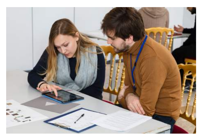
Figure 2. Subjective mapping following the exhibition visit