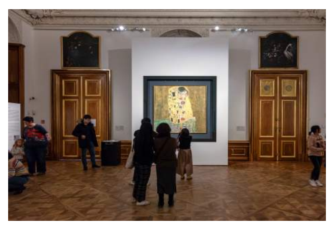
Figure 6. Installation shot with "The Kiss" in BA

In comparison to other artworks in the higher ranks, where three out of seven change their ranks, "The Kiss" remains the clear number one in terms of attention time. More specifically, the artwork holds an extremely high mean viewing time of almost one minute in BB (M = 56.94 sec, SD = 38.57) as well as in BA (M = 57.92 sec, SD = 48.54). Accordingly, "The Kiss" also received the highest number of looks (BB: M = 27.62, SD = 25.76; BA: M = 28.02, SD = 23.25) compared to the average number of looks per artwork (BB: M = 7.58, SD = 8.69; BA: M = 9.08, SD = 10.28). The repeated returns to the work can be ascribed to the fact that the exhibition room tends to be crowded (which leads visitors to look at other visitors, or at other artworks, while waiting to look at "The Kiss") and