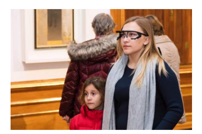
Figure 1. Individual exhibition visit with MET equipment

MET has already been applied in museum studies (see above) and proven to be an insightful method due to the richness of the data gained, which also enables statistical analysis (Eghbal-Azar & Widlok, 2013; Garbutt et al., 2020; Mayr et al., 2009). However, one of the main challenges of employing MET is extracting semantic meaning from the raw gaze data in relation to the stimuli (e.g., a painting on the wall of the museum), as these stimuli are consistently viewed from different perspectives. The eye movement data regarding the objects looked at (e.g. a specific artwork or label) is not a direct output of the recording software but a video of the scene camera with an estimated gaze point relative to the video frame. Moreover, regular fast-paced head movements (leading to motion blur in the captured images), the low dynamic range of the eye tracker's field camera, and frequent partial occlusion of artworks due to the presence of other visitors make the automatic labeling a challenging task. Given these technical